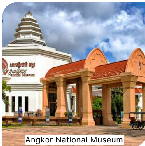
Angkor National Museum