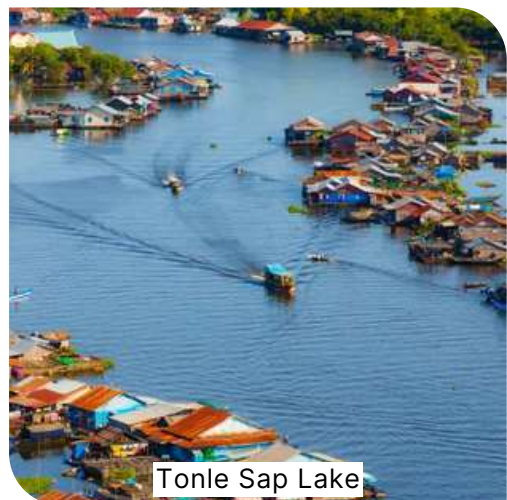
Tonle Sap Lake